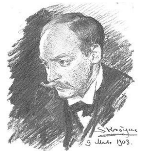
Hugo Alfvén (d. May 8, 1960)

2010 commemorates the fifty-year anniversary of the death of Swedish music conductor and composer Hugo Alfvén. Alfvén was born May 1, 1872, in Stockholm, the fourth of six children. His father, a highly regarded tailor, was also a church choir director. Alfvén's childhood summers were usually spent with relatives in the Stockholm archipelago, a common place for nature-loving Swedes. His memories of these times in the archipelago would be a source of inspiration for some of his later works.