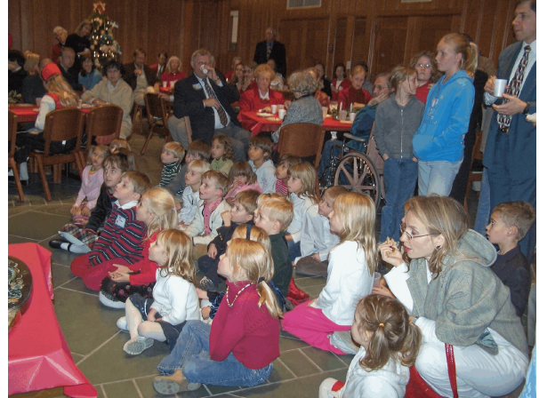
Everyone listens intently to the story of the jul tomte