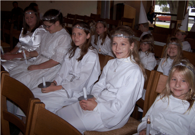
Children wait patiently before processional