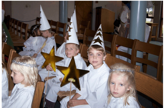
Star boys are ready to go