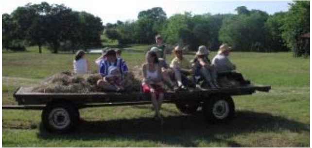
See Page 8 for more pictures.