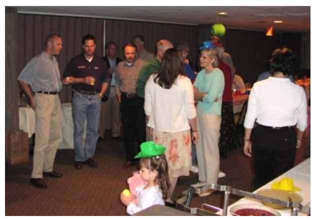
<Lot of time for fellowship >