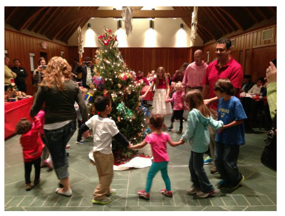
Families dancing around the tree