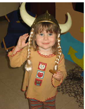
Viking helmets were very popular!

One class participated in a Lucia procession to the other classes, then each class spent some time in the music room, which had been decorated with maps, pictures and display items from Sweden. The children heard a little about Sweden, played a Swedish game, played dress-up with Viking helmets and swords, colored a Dala