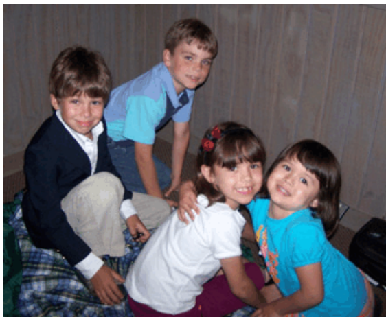
Even the kids had a great time!