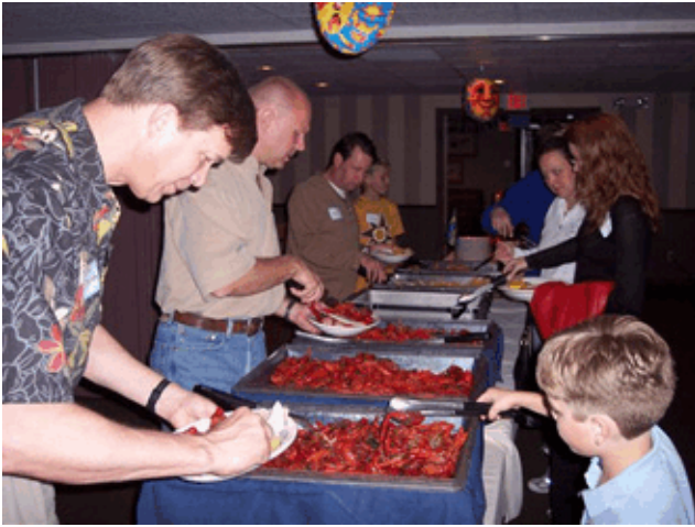
There were plenty of kräftor (crayfish) for everyone!

If you missed it, make your plans now for next year!!