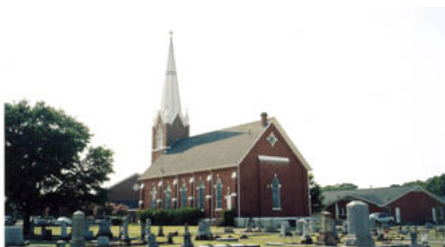
Palm Valley Lutheran Church, ca. 2006

The Texas Swedish Pioneer Association will observe the 90 th anniversary of this annual meeting, which has met each year since 1917. The date is Sunday, June 24, 2007, in Palm Valley Lutheran Church, Round Rock, Texas, located at 2500 E. Palm Valley Blvd./US Hwy. 79N, about 2.5 miles east of IH-35, near Dell Diamond baseball stadium. 155 years ago, in 1852, the first Swedes settled in this beautiful Palm Valley location.