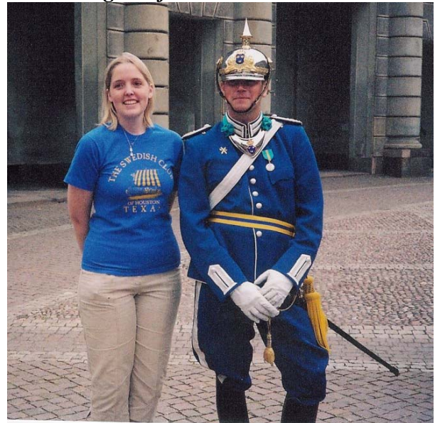
< No it is Not London but Stockholm >

EditorsNote: These two pictures look much better in color on the website: