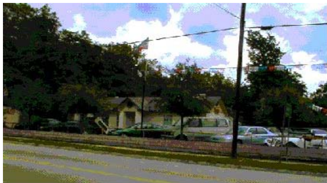
4608 Fulton as it looks today