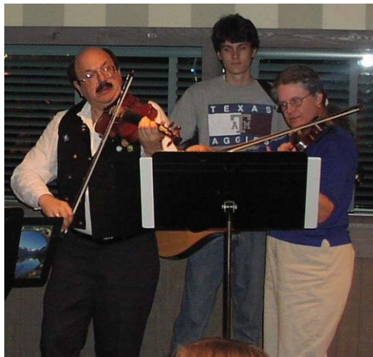
< Enlivening our Kräftskiva >