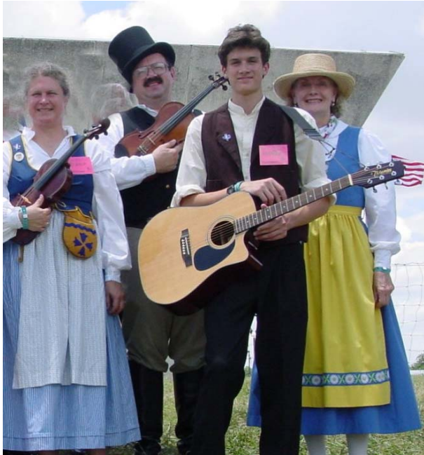
< Folklife Support of Dancers >