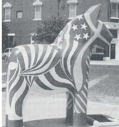
ANSWER:See page 10